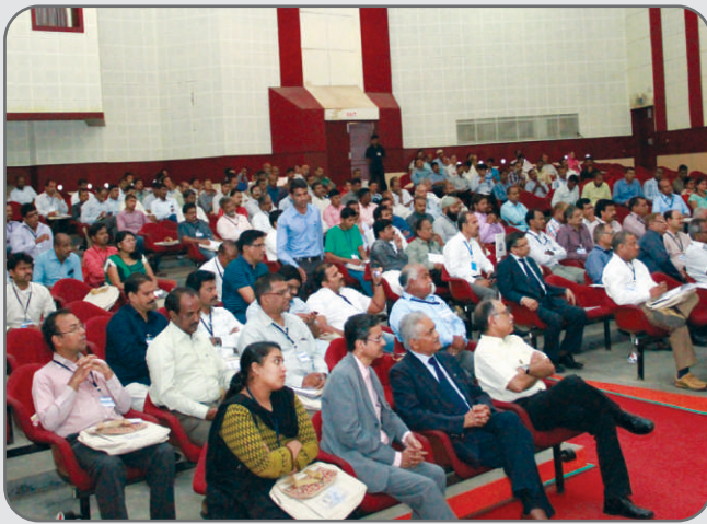
Participants of the National workshop on Forensic Science in May 2014