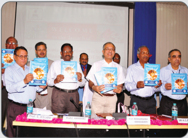
Vice-Chancellor & Pro Vice-Chancellor releasing the brochure of PGDTTM Programme.