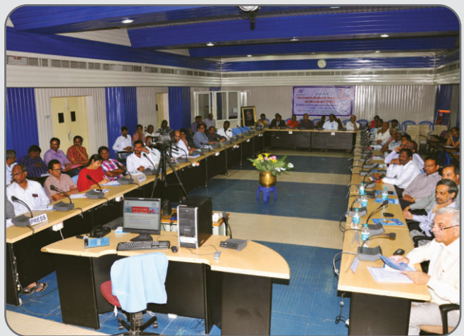
Participants of the seminar on Post-Graduate Diploma in Telecom Technology and Management.