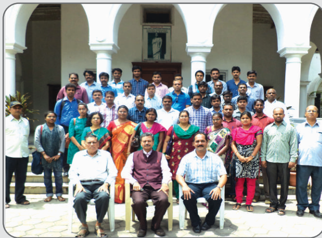
Participants of the PGDCL & IPR Programme.