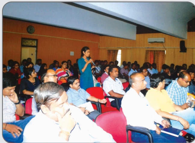
PGDBM Students during Contact classes.