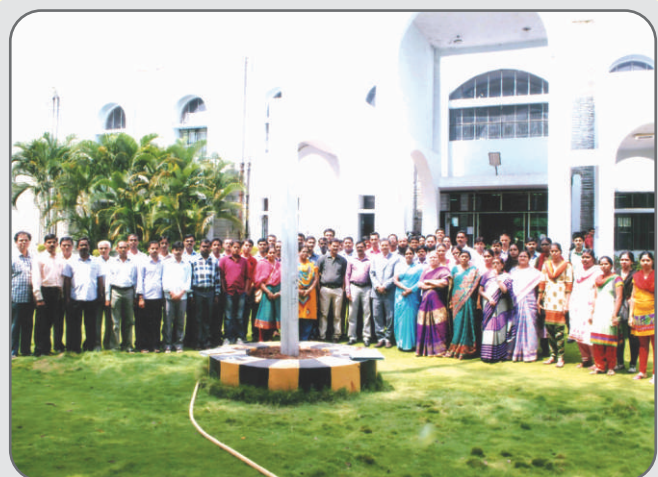
Participants of PGDLAN Programme