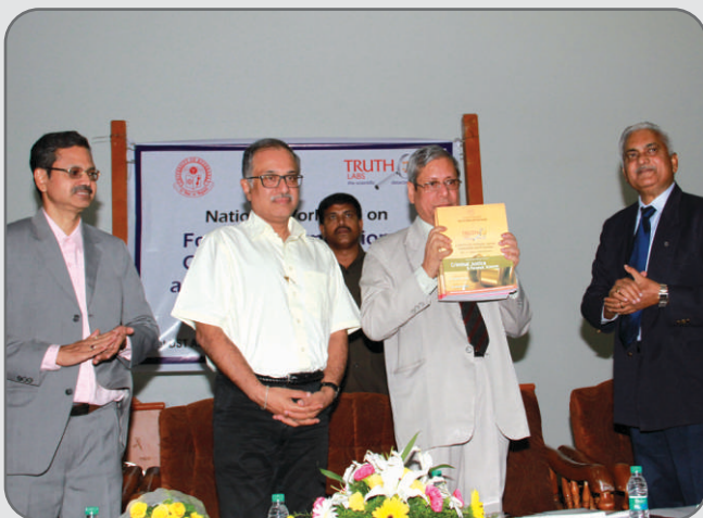
Hon'ble Chief Justice of Highcourt of Judicature at Hyderabad Justice Kalyan Jyoti Sengupta releasing the PGDCJ & FS Course Material.