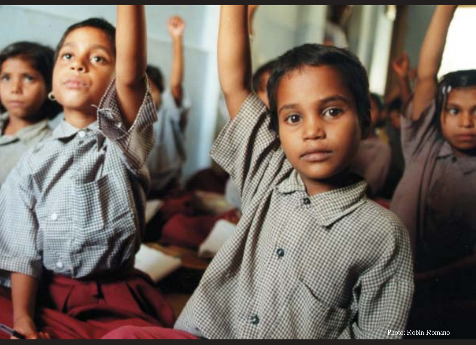
Education and other services are alternatives to involvement in illegal activities.