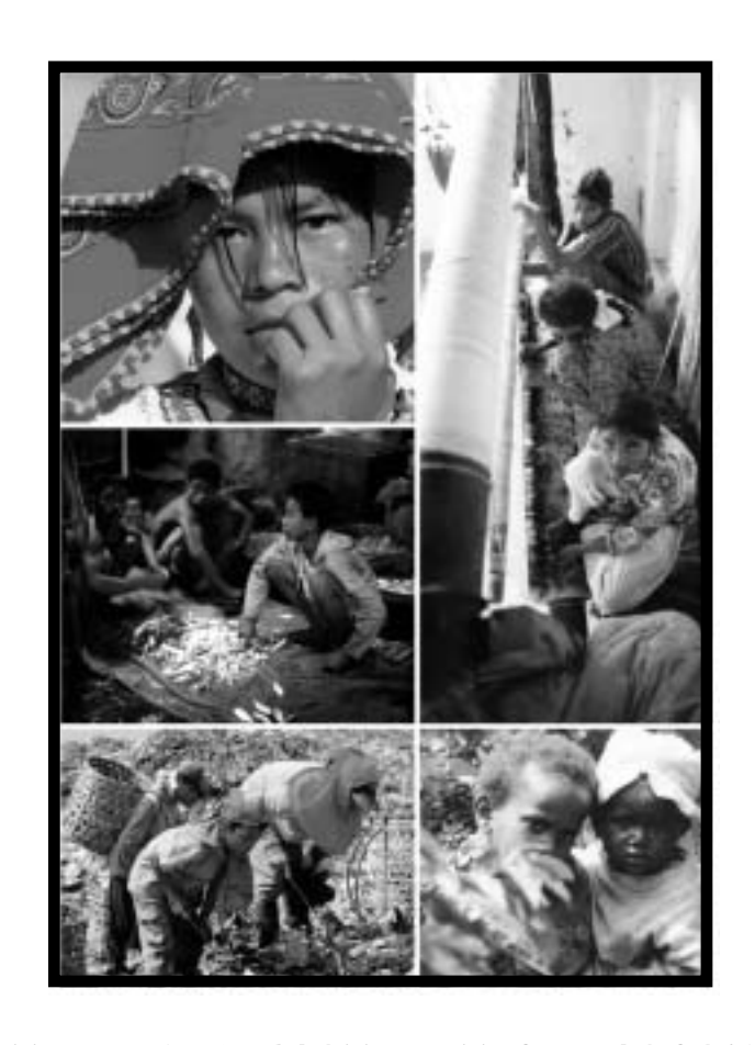
THE U.S. DEPARTMENT OF LABOR'S

2003 FINDINGS ON THE WORST FORMS OF CHILD LABOR