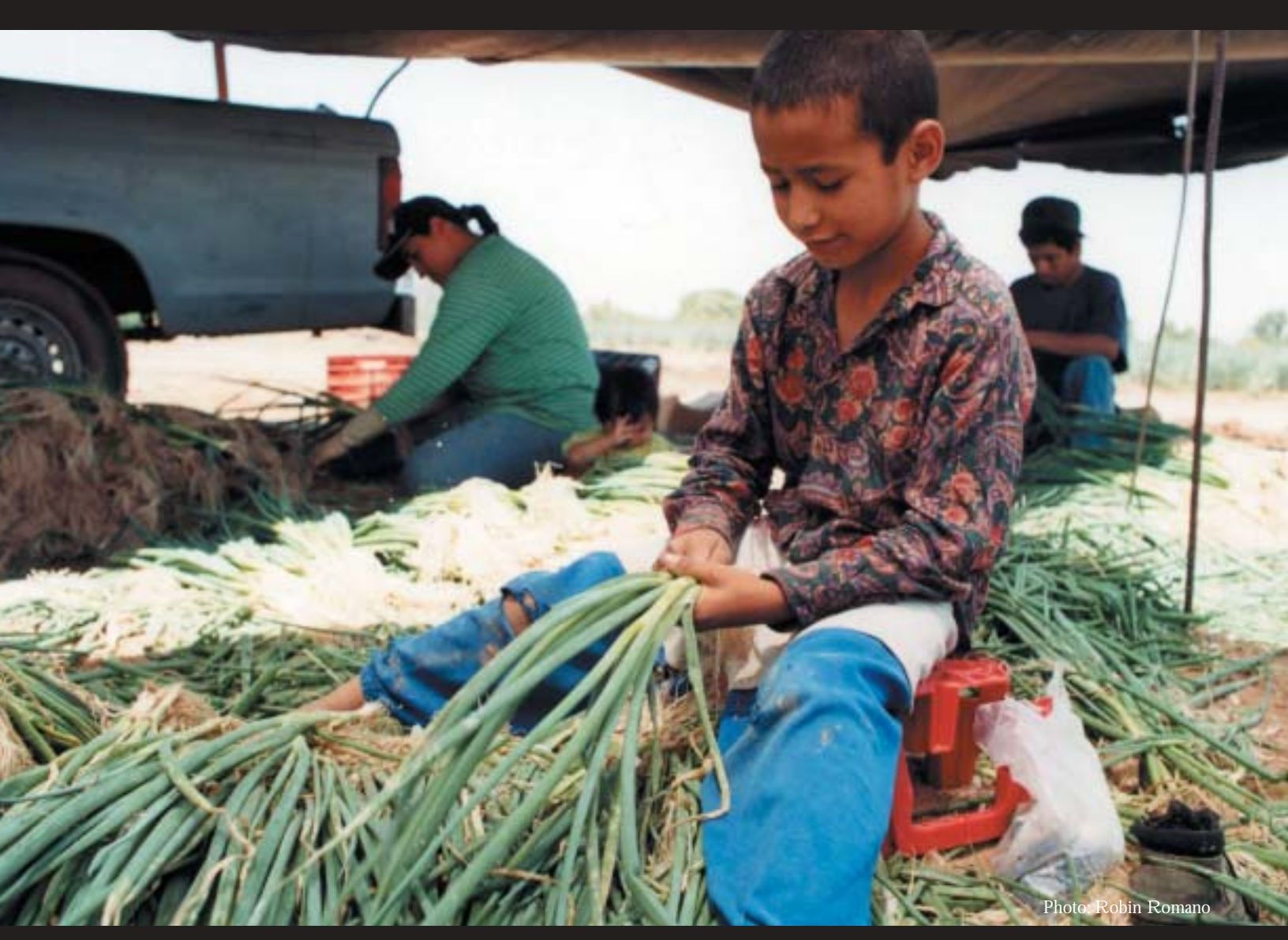
A young boy harvests produce.