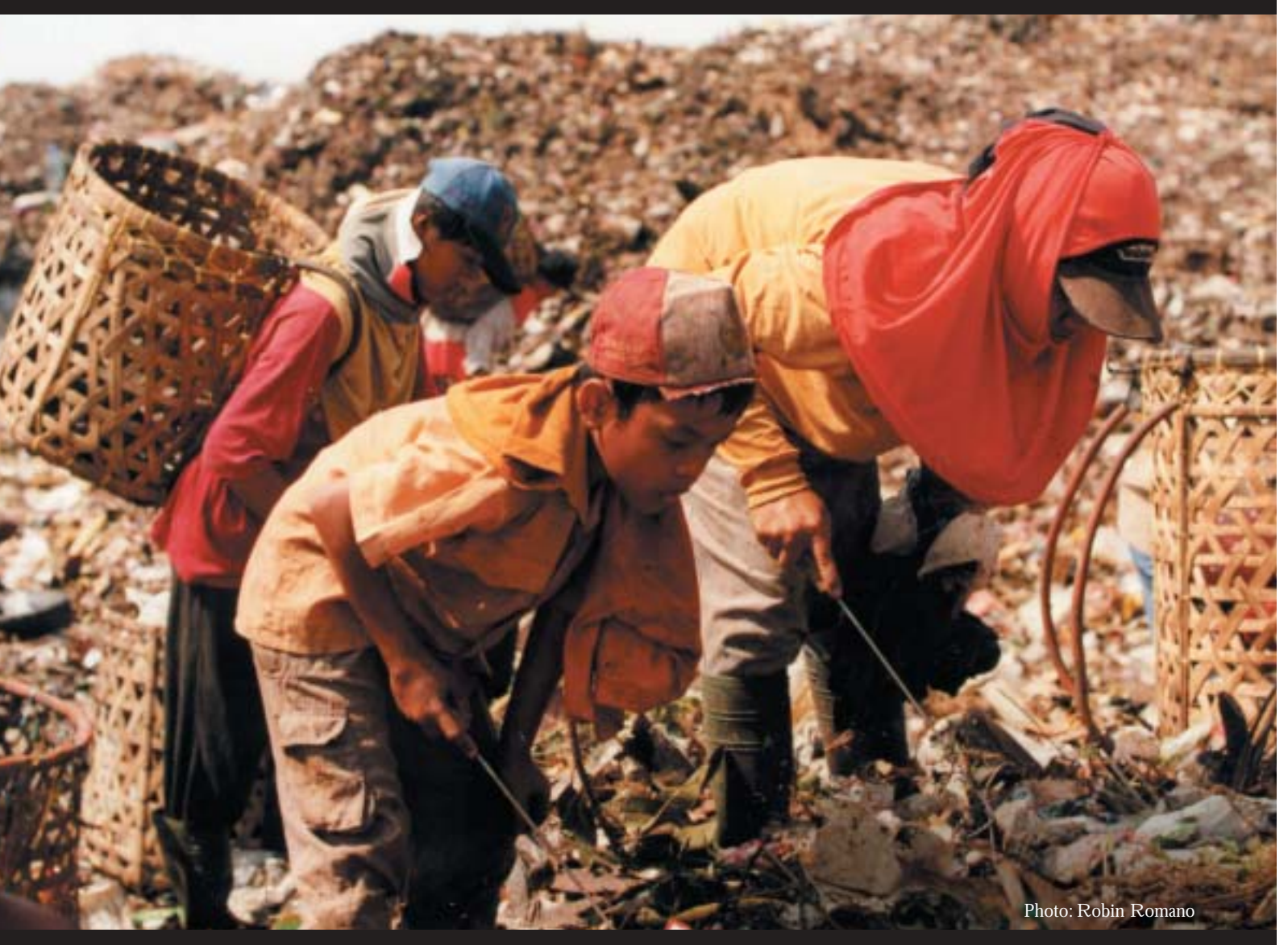
Children working in garbage dumps are exposed to a variety of hazards.