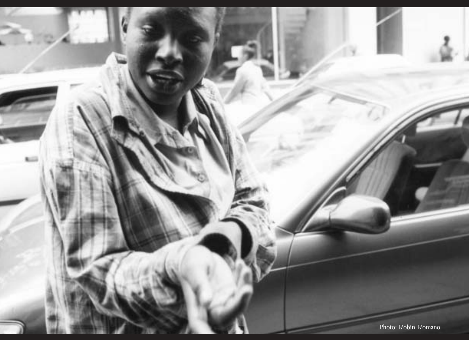
Many children are trafficked into commercial sexual exploitation.