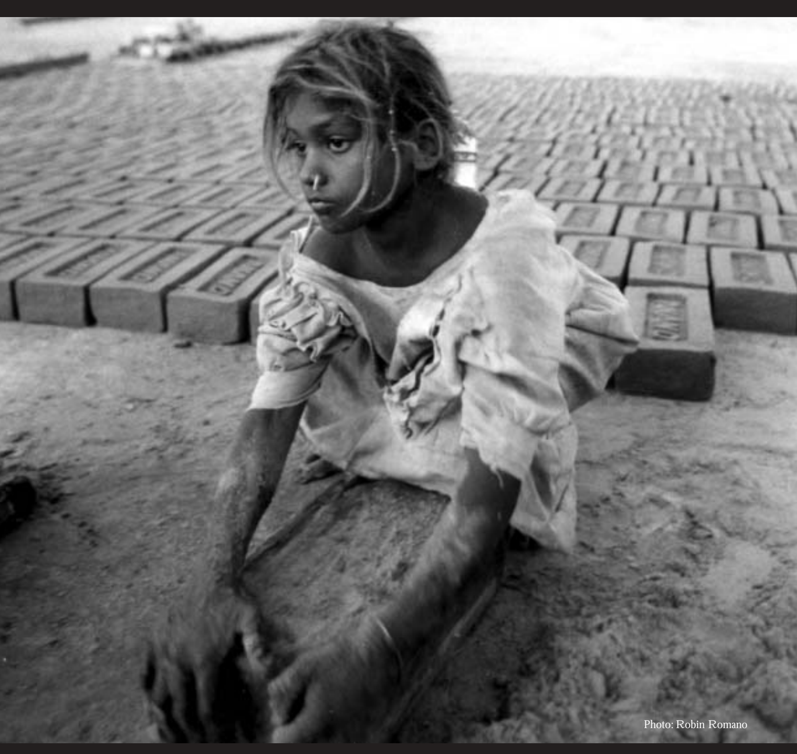
A young girl prepares bricks for firing.