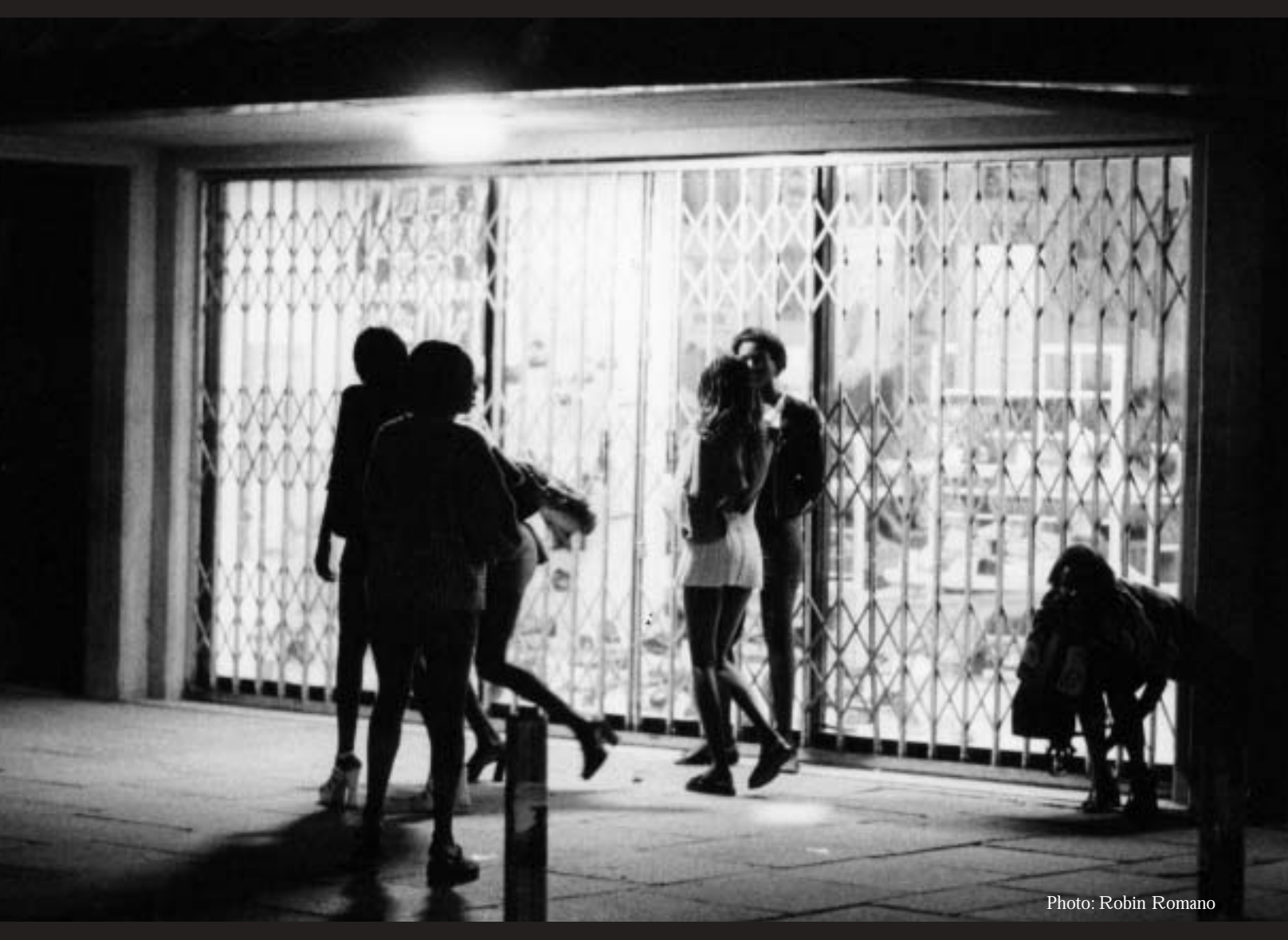
Children involved in commercial sexual exploitation are at increased risk for contracting HIV/AIDS.