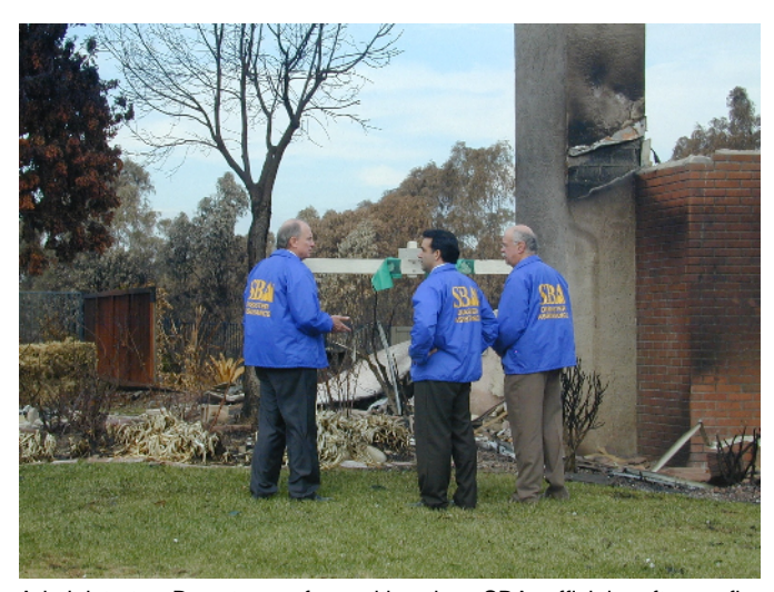
Administrator Barreto confers with other SBA officials after a fire destroyed buildings in San Diego in November 2003.

Through SBA's Disaster Loan program, individuals and businesses adversely affected by physical disasters can borrow funds at low interest rates for extended periods. SBA's disaster loans help homeowners, renters, businesses of all sizes, and nonprofit organizations finance rebuilding and recovery efforts. Working primarily with the Department of Homeland Security, SBA sets up temporary field offices in disaster areas to help the public apply for low-interest construction and economic assistance loans. The 2005 Budget requests funding to support $792 million in disaster loans.