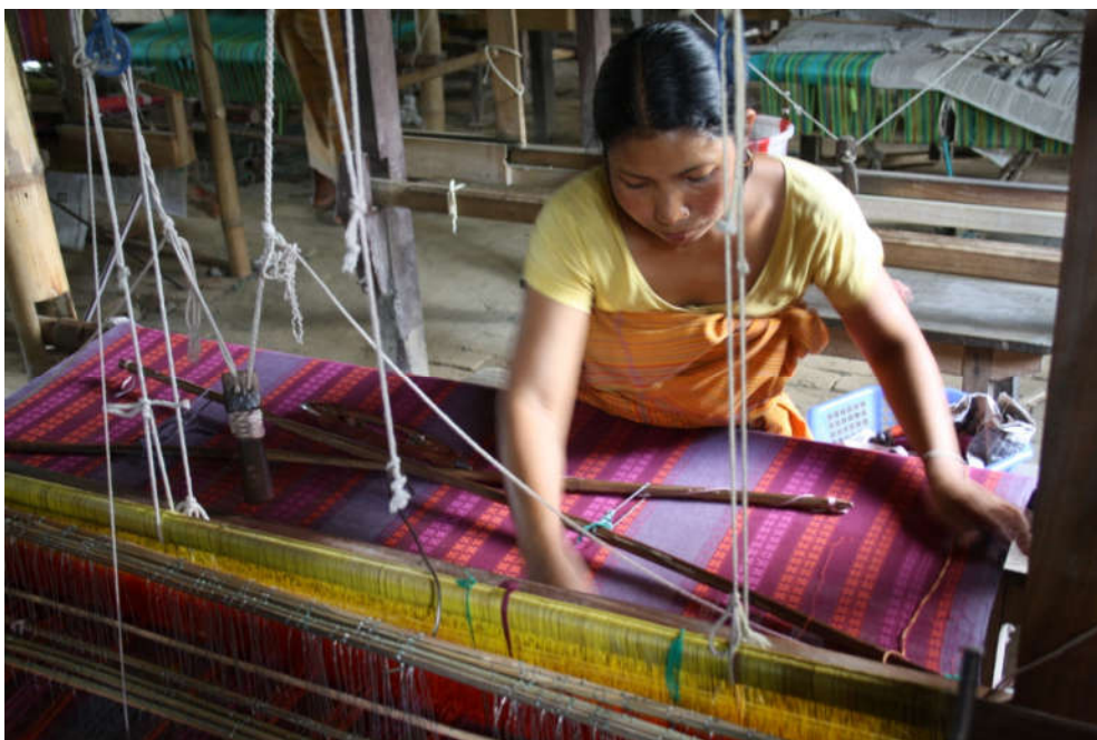
Photo 4: The above photo shows weaving their Boro traditional dress 'Dokhona'

In the Kamrup district of Assam, Sualkuchi Silk Industry is the region in Assam which is exclusively into silk weaving and referred to as 'Manchester of Assam'. According to the the Department of Industries and Commerce, Assam has presently all about 7,00,000 looms , but powered looms are of limited quantities and are mainly found in Sualkuchi. These are mostly used for the commercial production of silk fabrics. Infact, the handloom industry of Sualkuchi deals with the three varieties of textiles commercially –Cotton, Silk and Khadi (Phukan, 2015) 83 .