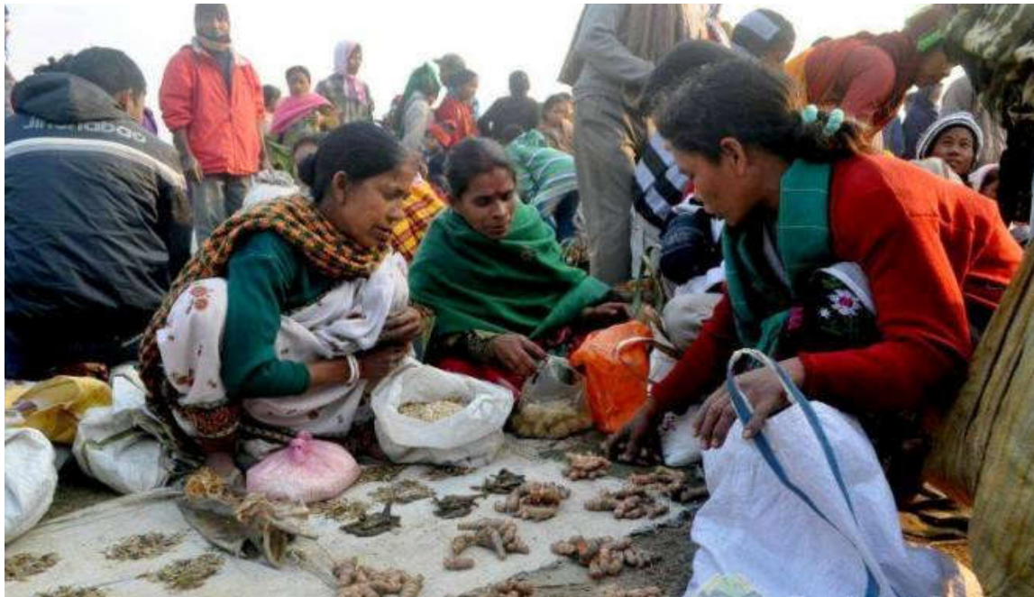
Photo 1: Indigenous local spices for barter trade at Jonbeel mela.

the Bodo society today, certain elements of barter system is visible even today. For instance the Bodo women are seen exchanging their vegetables and fruits grown at their respective backyard with their neighbours merrily. All these instances manifest the feeling of community belongingness amidst all the chaos of this world 77 .